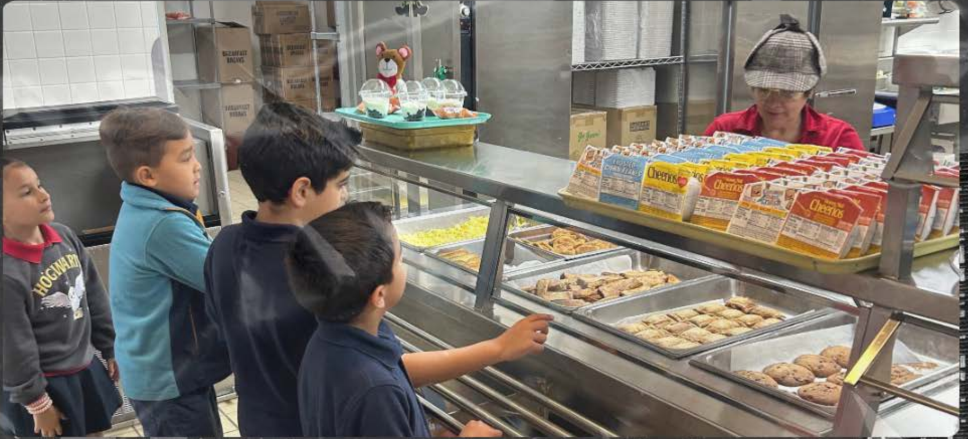
Dr. Gilbert Porter Elementary